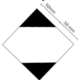
Signal for containers with limited quantities